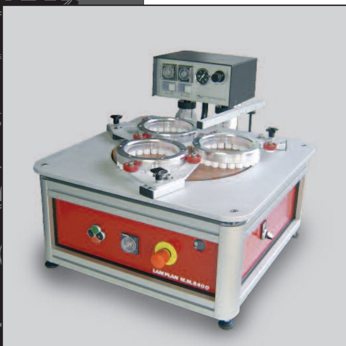
MM 8400 fitted with the 809 B dispenser.