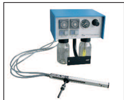
Dispenser 809 B

LAM PLAN S.A. 7 rue des Jardins BP 15 74240 GAILLARD France Tél. 33 (0)4 50 43 96 30 Fax 33 (0)4 50 87 01 60 www.lamplan.com email : mmsystem@lamplan.fr